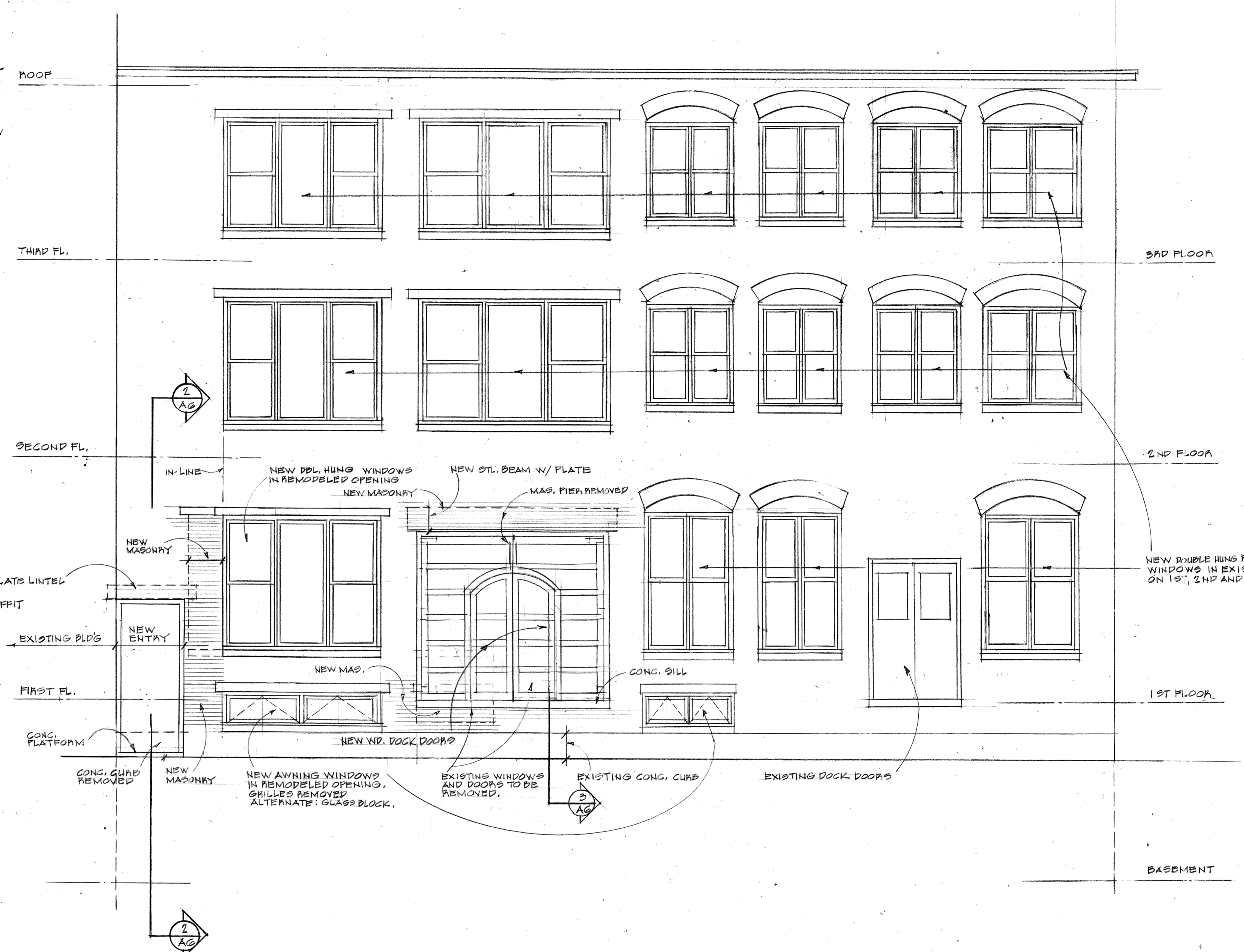
4 WEST ELEVATION A6 SCALE 1/4"=1'-0"